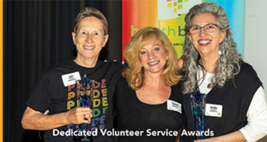
Dedicated Volunteer Service Awards

Volunteer Hours: 14,084 Value of Hours: $568,821