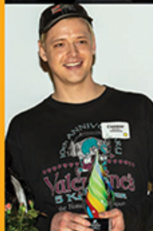
Dedicated Volunteer Service Awards