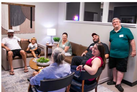
Ainsworth family enjoy the remodeled lobby space during their visit.